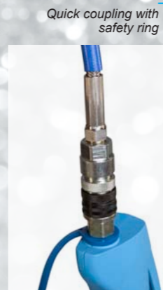
Quick coupling with safety ring