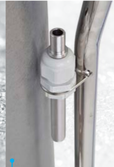
Holder for Jet Nozzle