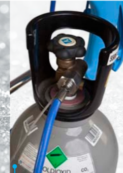
Region adapted connection

Cryonite® can be used alone, but is also a perfect complement to other treatments. It can become a regular part of hygiene routines, and contribute to maintaining an insect-free environment. Just freeze with Cryonite® – it is a simple way to eliminate insects.