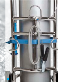
Back side of Trolley/Cart