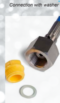
Connection with washer